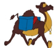
Blitzen #359 West. Colorado

NEXT STOP – CASA GRANDE NATIONAL MONUMENT