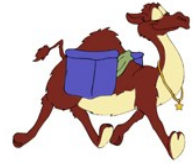
Dancer #98 Gr. Phoenix