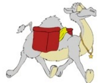
Donner #356 Colo. Springs