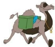
Comet #248 El Paso