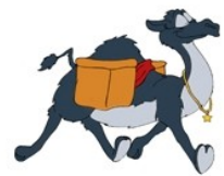
Prancer #112 Metro Denver