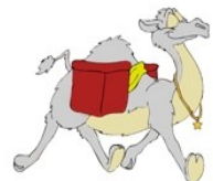
Donner #356 Colo. Springs