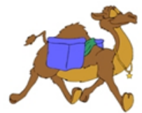
Vixen #122 Tucson